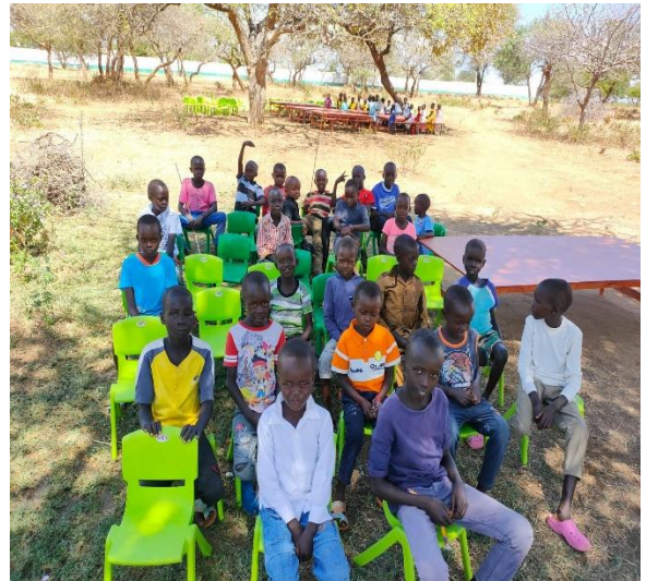
Children Waiting for Christmas Dinner!

Pray for wisdom on our part to discern when it is safe for us to travel to Kenya again.