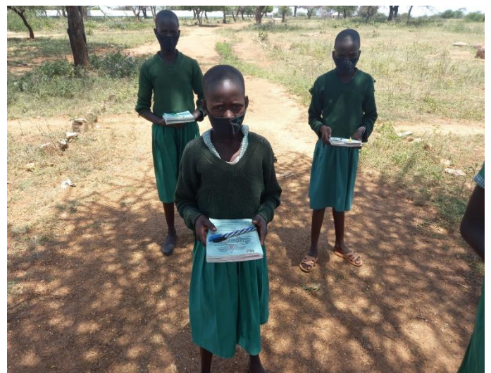
Children in the sponsorship program receiving school supplies!